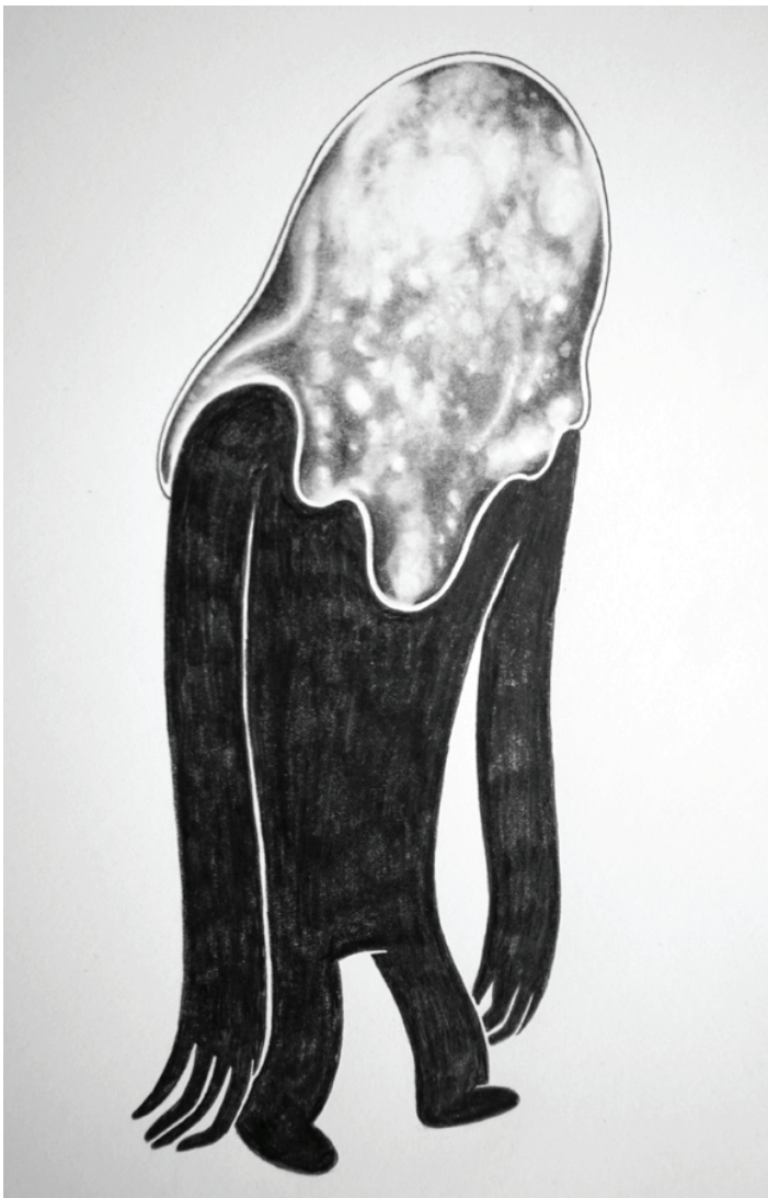
studio view and a character from the comic novel SUMPFLAND 2018