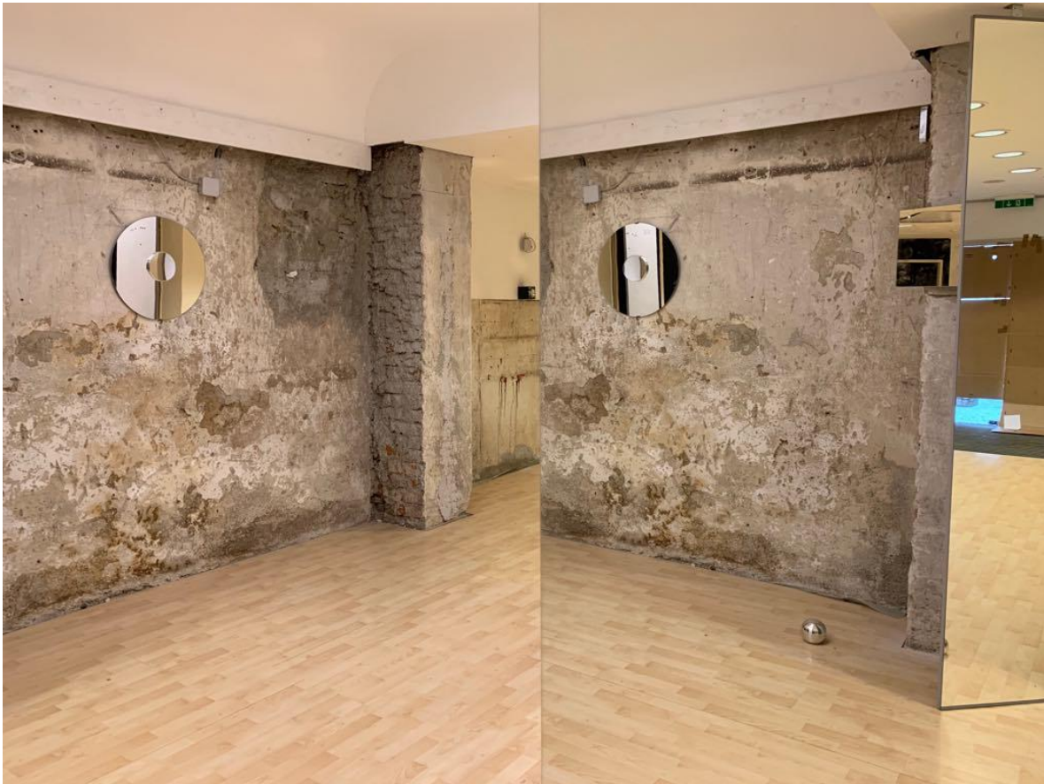
Privacy: the paradox of our time. Picture of installation by Alan Rios Cruz