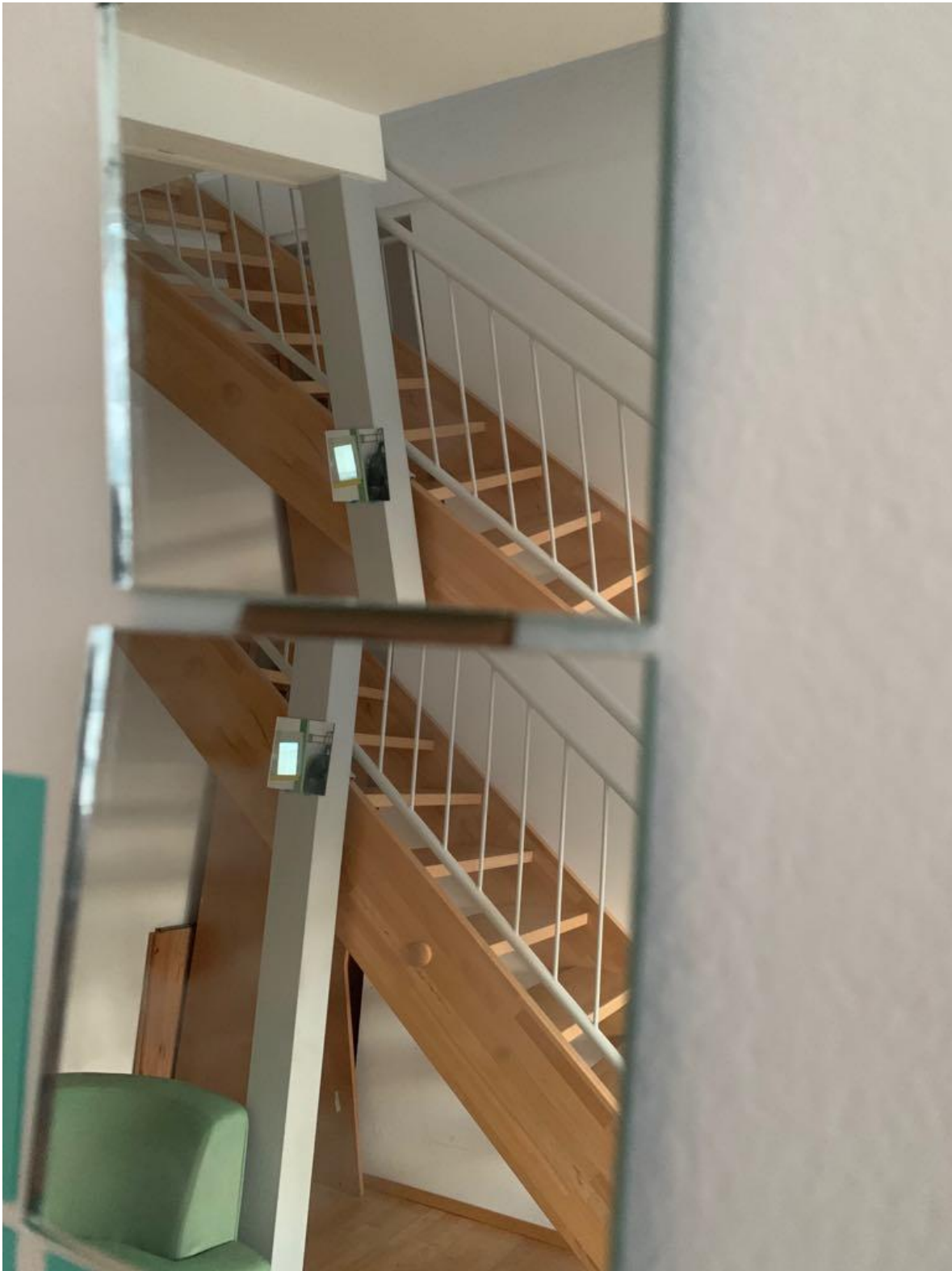
Test made in Krems before having the site for the installation.