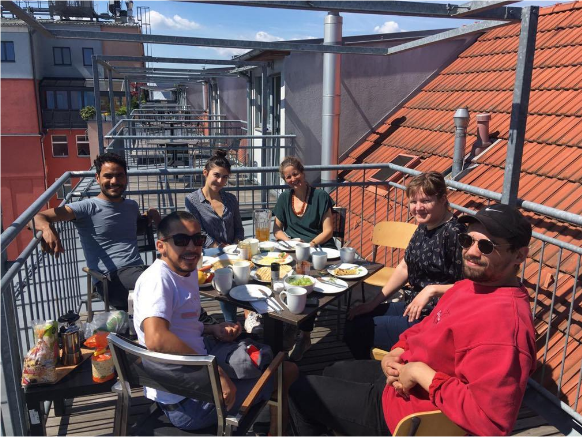
Going away breakfast with fellow residents.