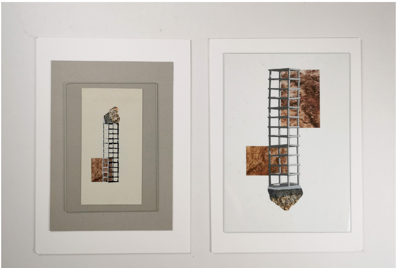
"State of Emergency", 2020