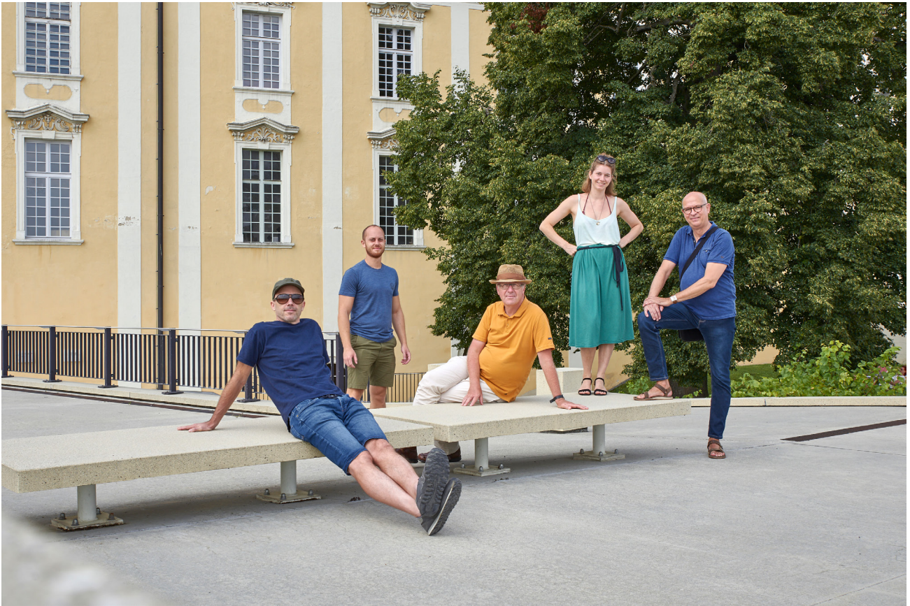
The AIR group in Stift Altenburg, August 2021