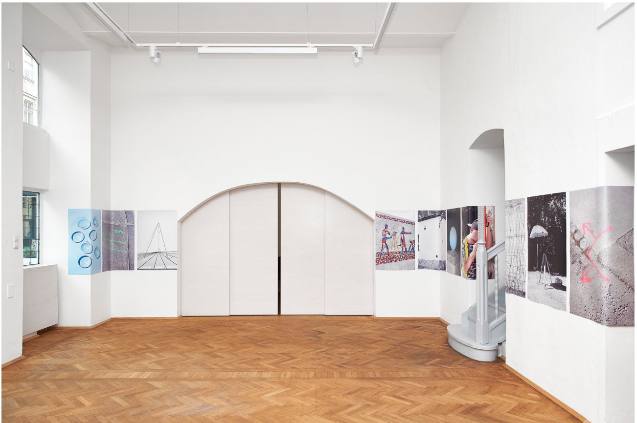
'ANGLE AND DISTANCE' (images from the series) - Installation view at LINKED - Exhibition of Ines Hochgerner and Benedek Regős at IG Bildende Kunst, Vienna