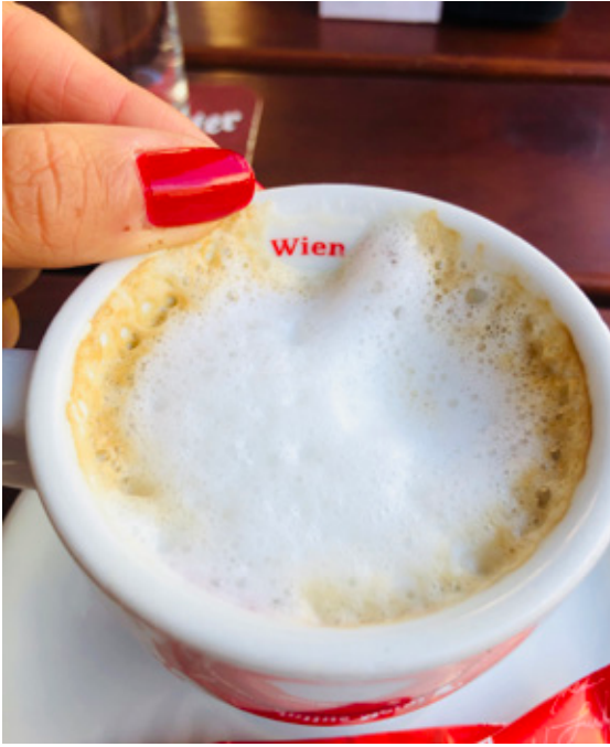
AiR – team trip to Biennale Vienna Parallel