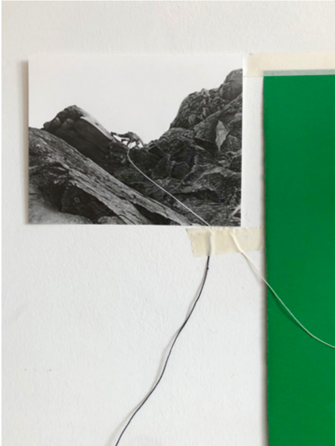
graphite drawing / made in Krems