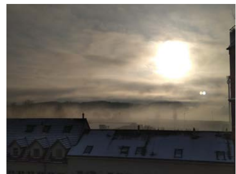
view from my window