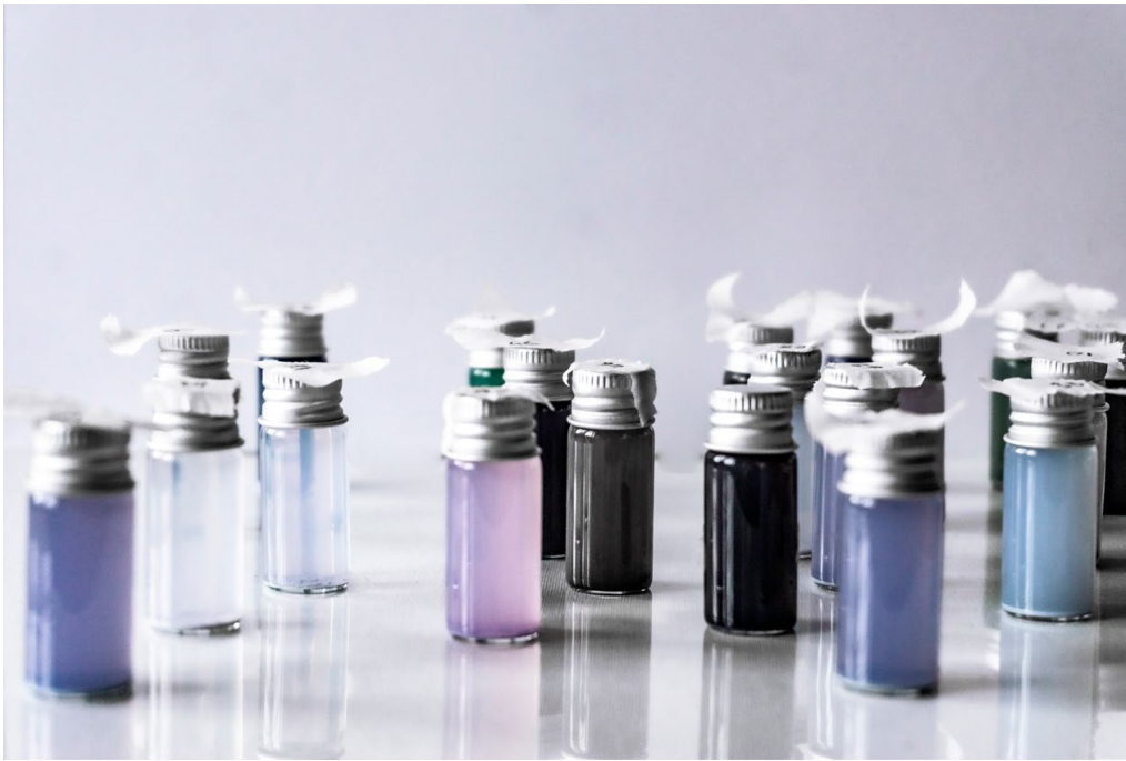
Image 1: vials of essences Image 2: section of paintings Image 3: painting closeup