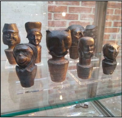
Far left: taken at Kunsthalle Krems at African Portraiture exhibition; taken at Landesgalerei at Rendezvous mit der Sammlung exhibition; taken at Museumkrems of local wine production exhibition.