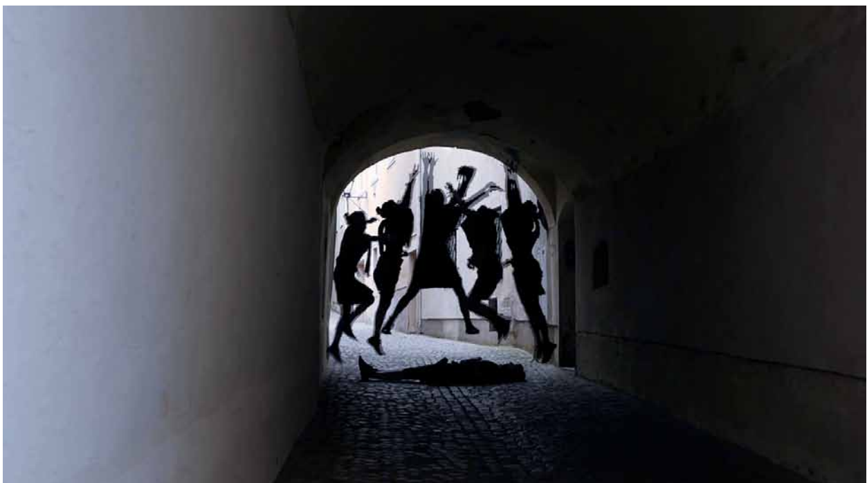
Still from the stop-animation 'The City Gate'

...Or you can close the passage and build a wall yourself, as we do most of the time.