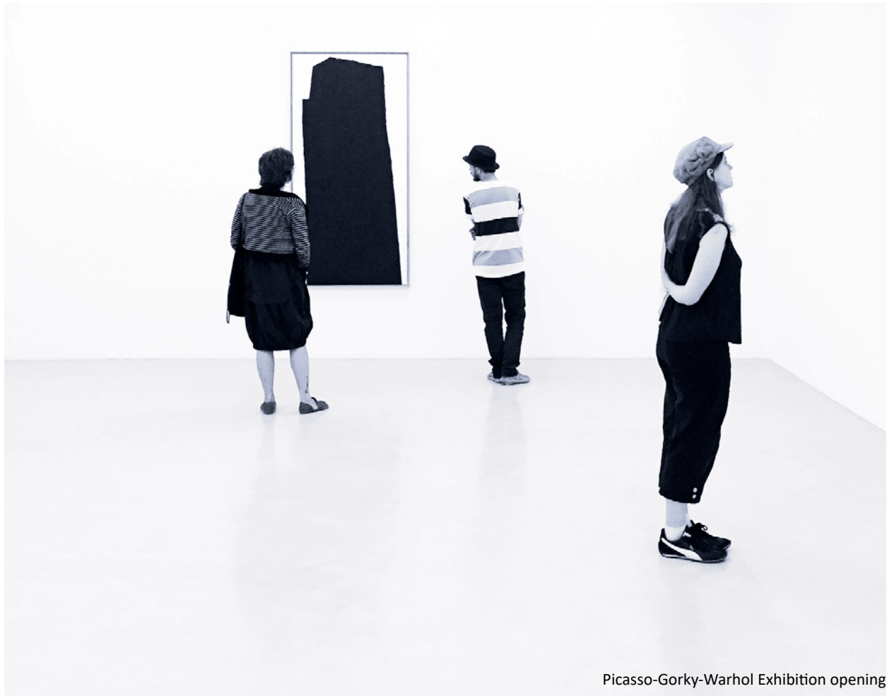
Picasso-Gorky-Warhol Exhibition opening