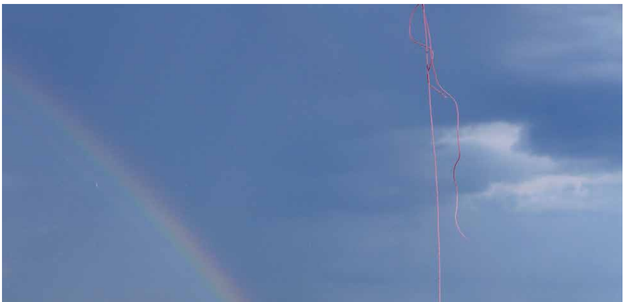
From the photo-video series 'The red string'