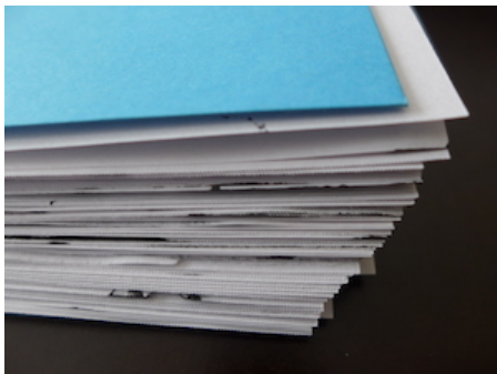
A pile of papers of drawings