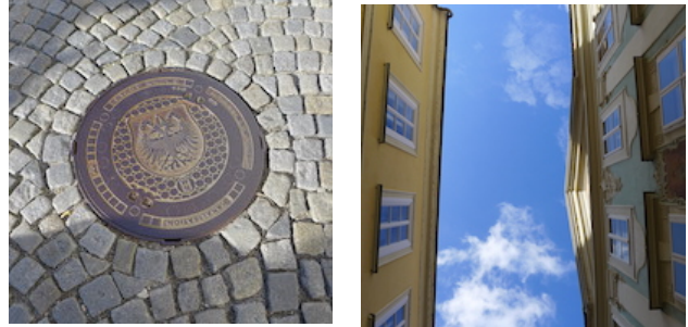
Excerpts from the video “Path of Light”