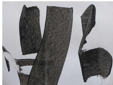
A part of Hiromi's drawing