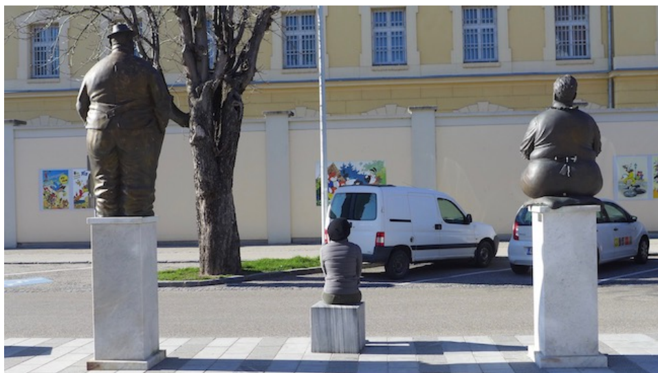
Thinking about social distance with friends