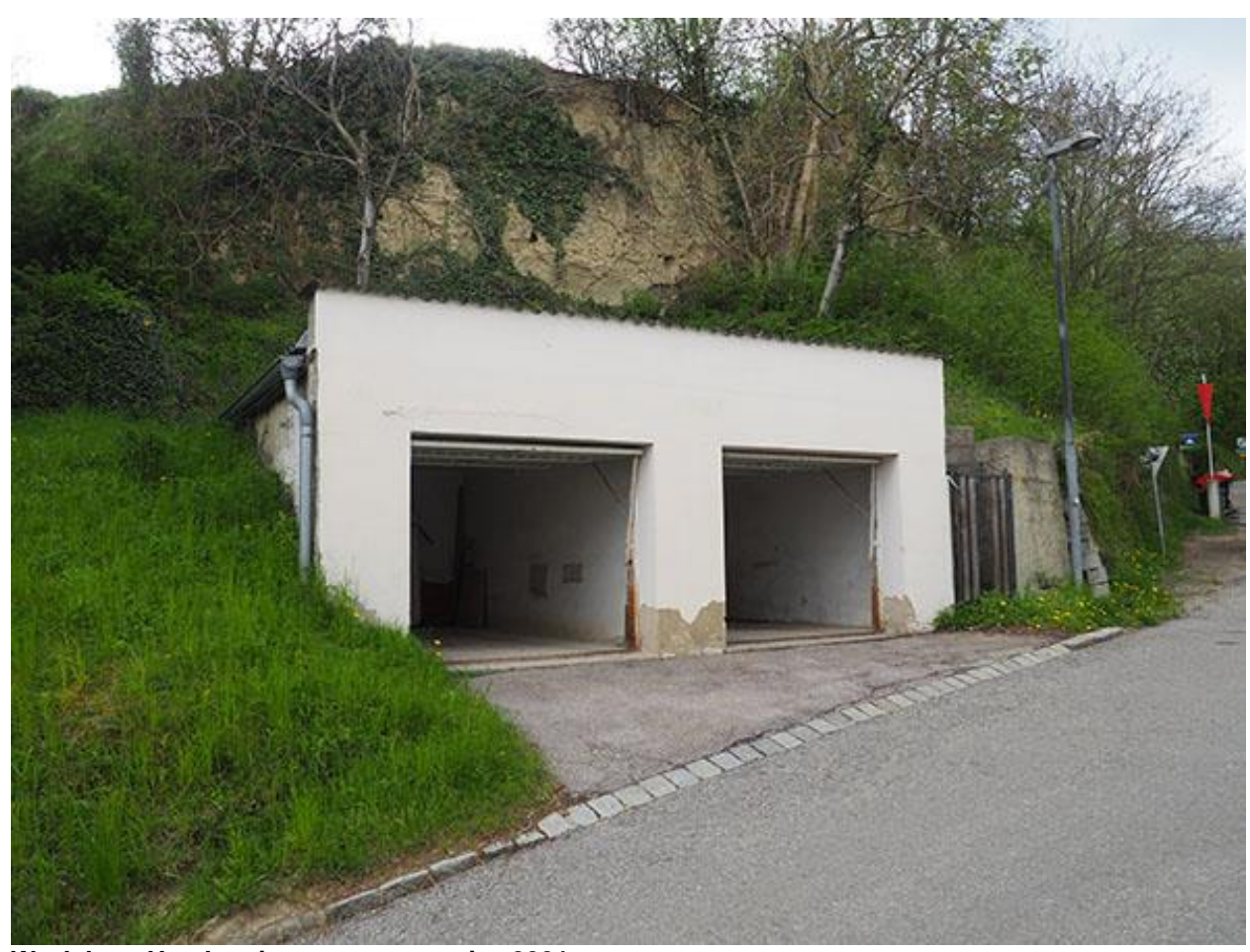
Wachtberg-Hundssteig contemporary site, 2021