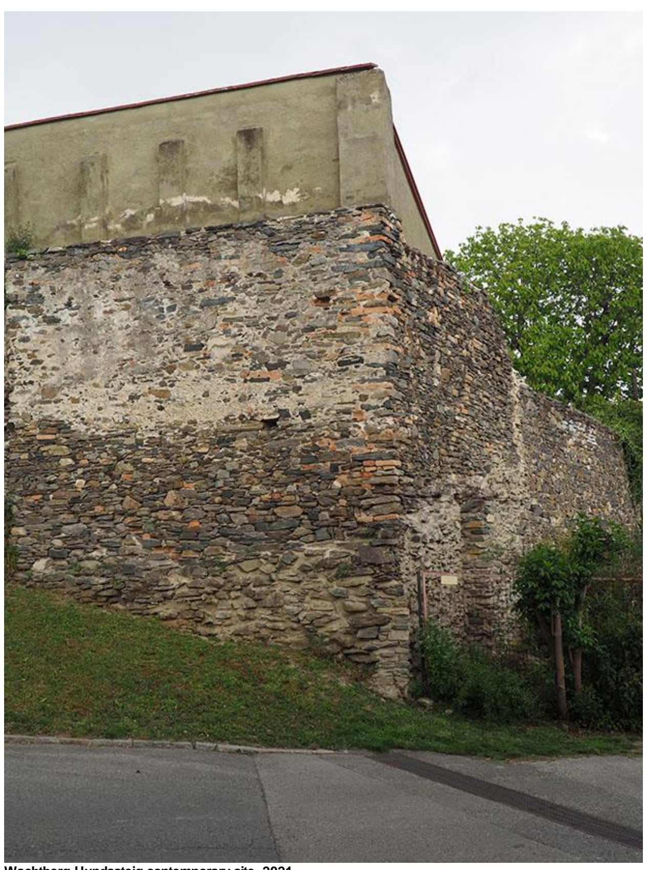
Wachtberg-Hundssteig contemporary site, 2021