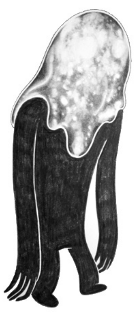
studio view and a character from the comic novel SUMPFLAND 2018