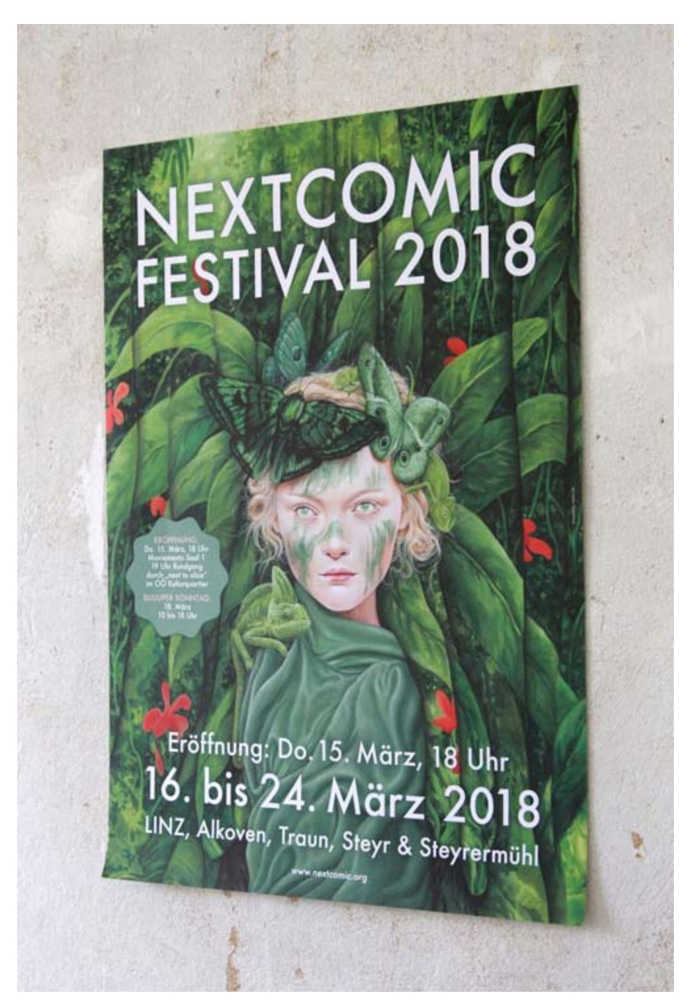
NEXTCOMIC FESTIVAL, LINZ 2018 - exhibition view and poster